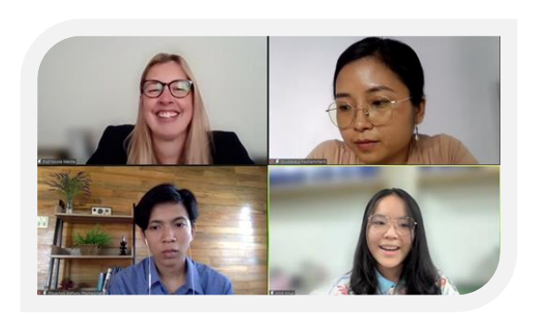
Figure 4 The screenshot of the panel discussion