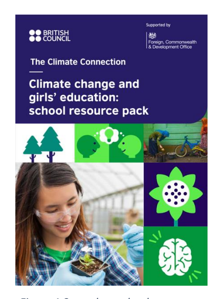
Figure 1 Secondary school resource pack

https://www.britishcouncil.or.th/en/schoolresource-pack